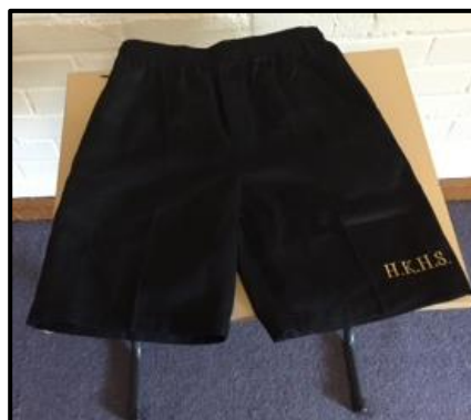
New school shorts for boys, replacing the grey shorts for 2016 and beyond