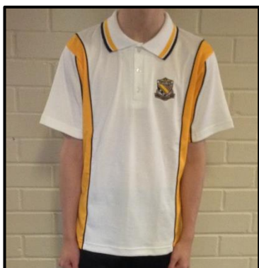
New sport shirt for 2016 and beyond